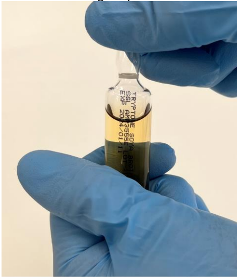
Breaking ampoule seal