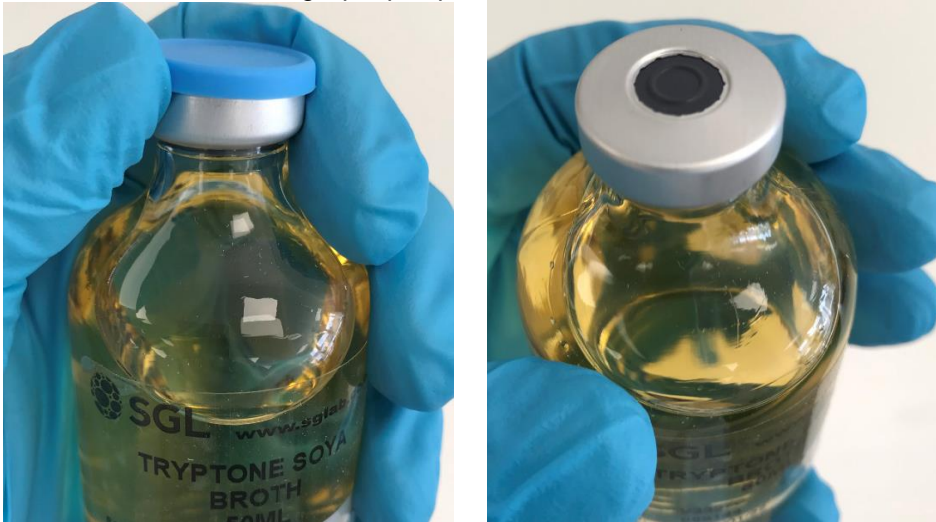
Removing flip top cap from injection vial